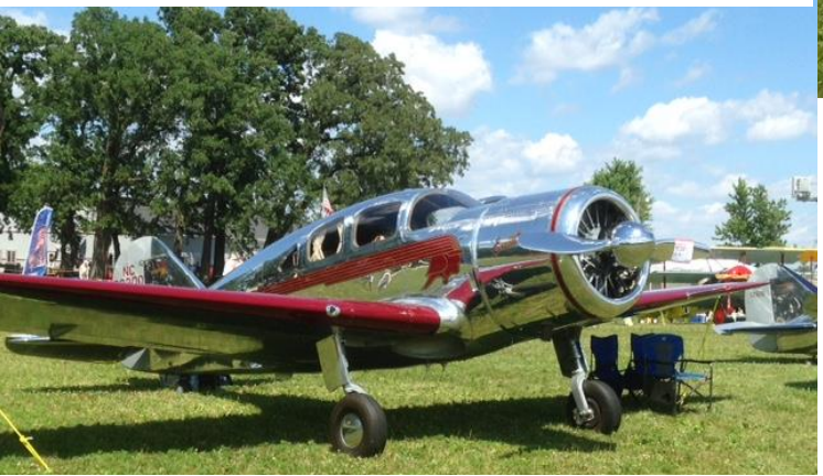
This is a cool looking plane, a 1937 Spartan 7W. Eight Spartans were present at Oshkosh and 20 out of the 34 produced still exist.