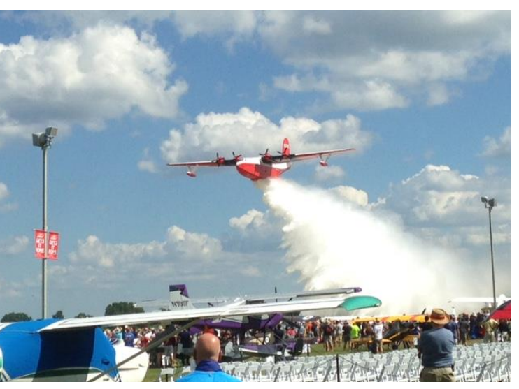
The Hawaii Mars, a flying boat water bomber, able to scoop and release 7,000 gallons of water performed a demo during the airshow on opening day.