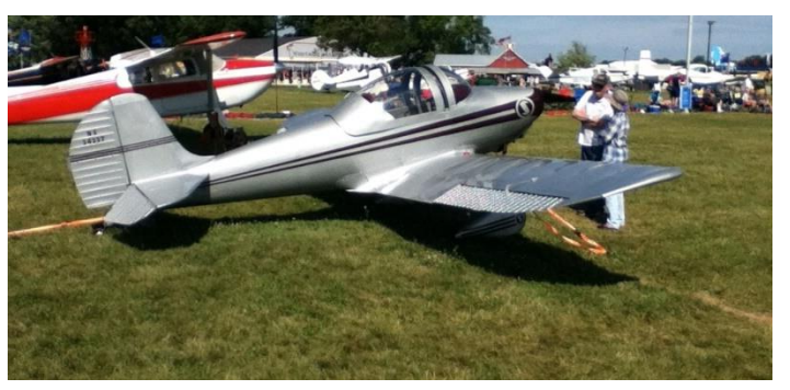
Can you name this plane? Seen at Oshkosh.