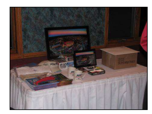
Thanks to all who donated prizes, including <u>Avery Tools</u>, <u>Van's Aircraft</u>, <u>Prange Photography</u> and Dean Hoy Insurance.