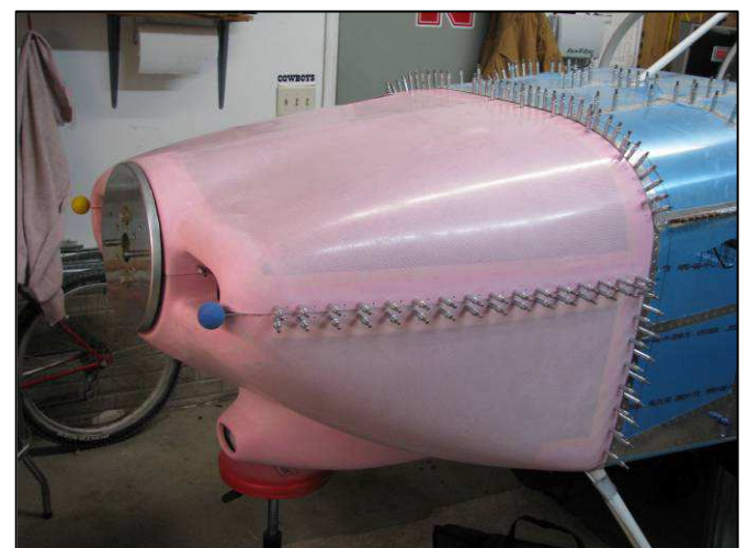
The piano hinges have yet to be riveted on. Van's suggests supplemental bonding of the hinge to the cowl.

from the edge. Ι then placed the cowl in position and then measured forward 2 inches from my reference line and marked the cowl for trimming. This worked real well. I trimmed and sanded the front and sides of the top cowl to form a nice straight and level edge.