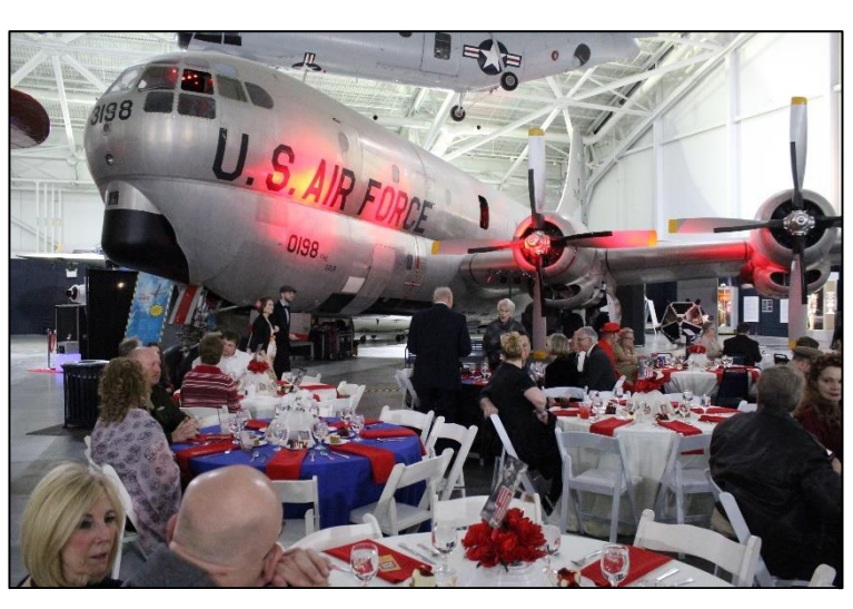
Where else can you eat under the wing of a KC-97 or by the nose of a B-29?