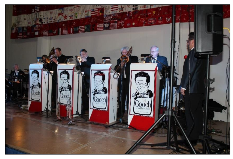
Gooch and the Guys supplied the music.