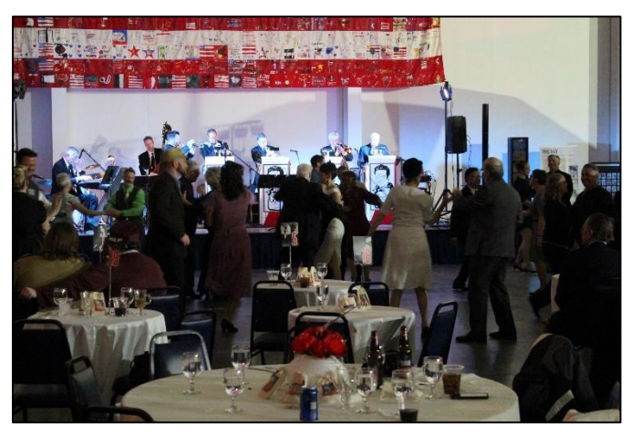
The dance floor was crowded and active all evening long.