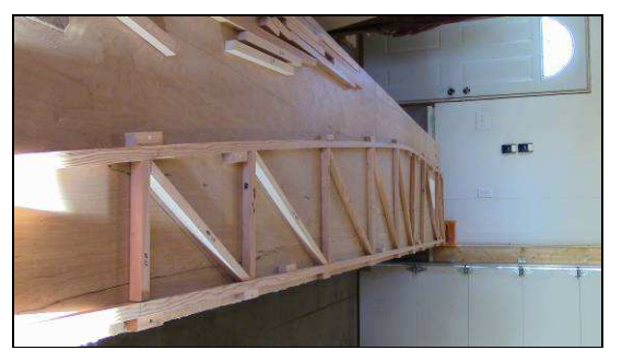
The length is 170", highest point 23.5".

Also just to clarify, last month's description of CG range is measured from the leading edge of the wing. The actual position of the wing can be moved for or aft to ensure the CG falls in the specified range and never aft of 20" from the leading edge. This works via real world test with either the Pietenpol FC-10 or Riblett 612 airfoil.