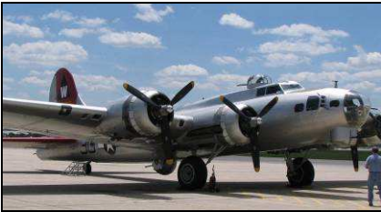
The B-17 on the ramp at LNK in July, 2008.

This will be the sixth time the aircraft has been displayed in Lincoln. EAA Chapter 569 will once again play host to the grand old airplane.