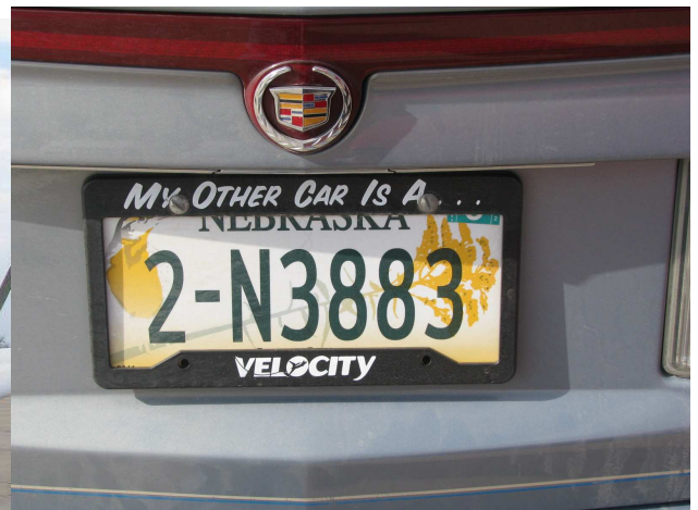
Wonder whose car this is??