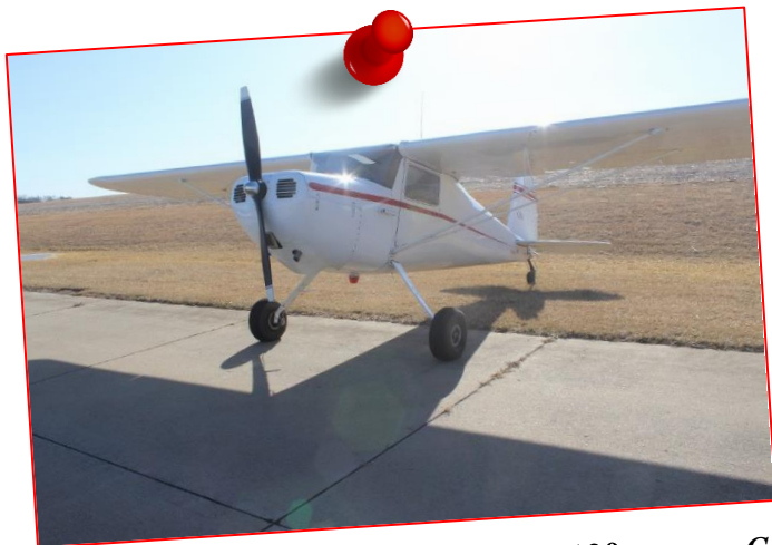
Brad Stauffer's Cessna 120