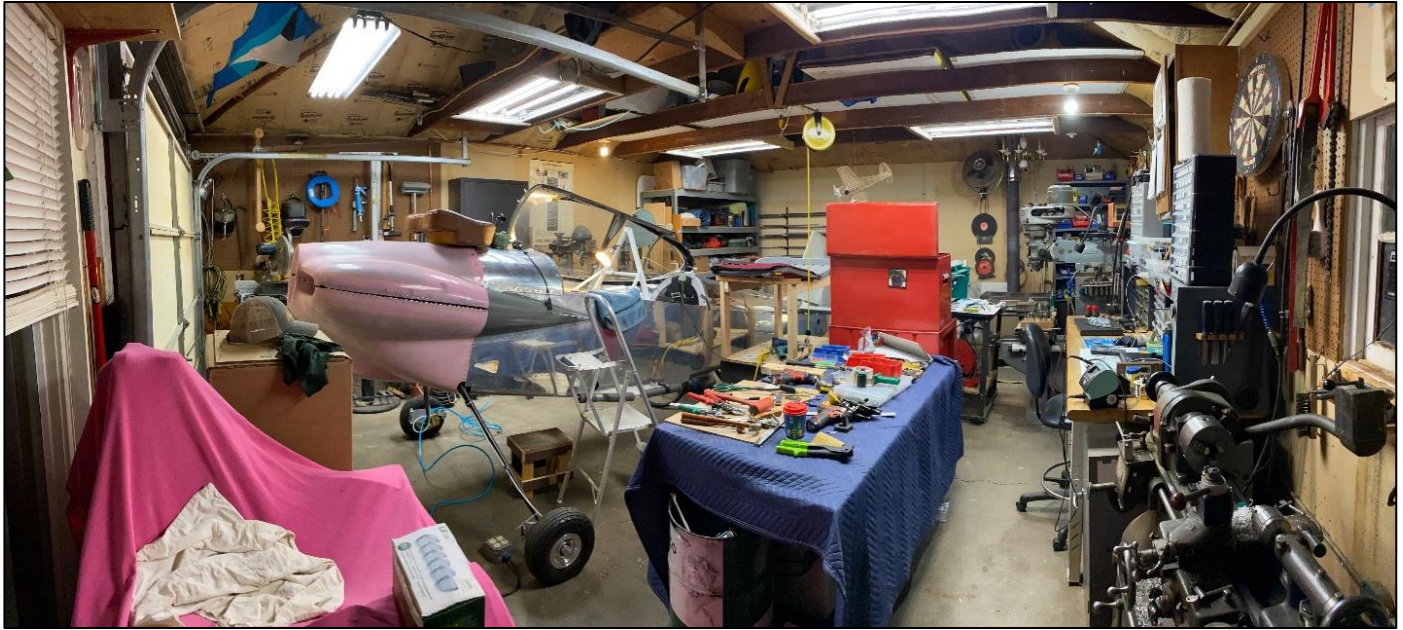
The Home Shop