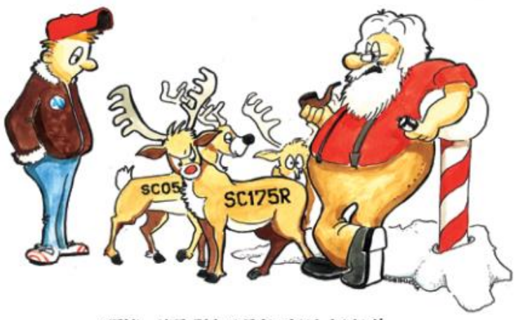
YEAH, THE FAA WENT NUTS AGAIN!