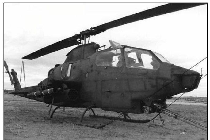
AH-1F fully modernized Cobra