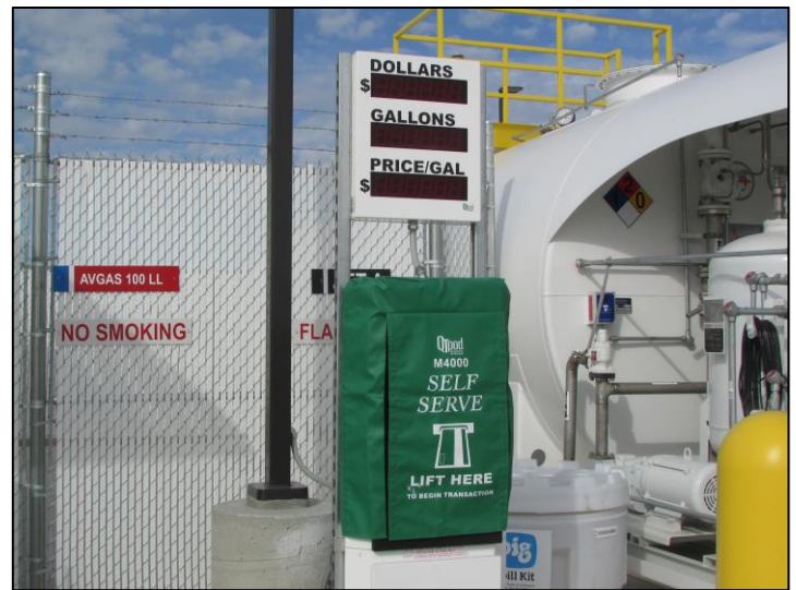
Lift cover, follow instructions.