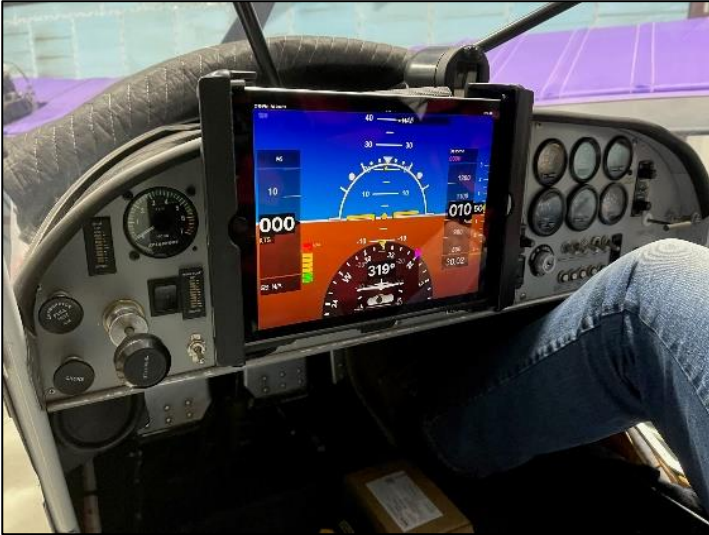
The BOM will give you angle of attack info along with indicated airspeed, WAAS GPS, AHRS, ADS-B in and data recording.