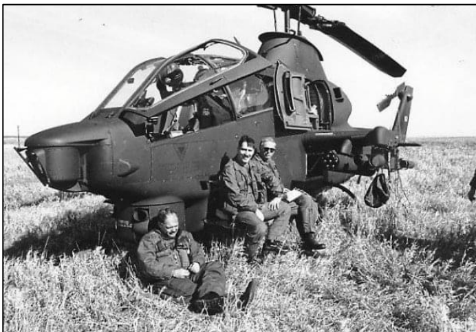
AH-1S Cobra gunship