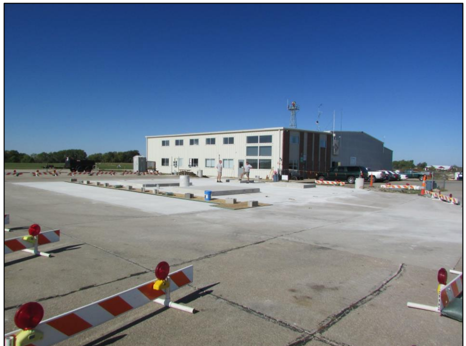
Two shots of the massive concrete foundation, as of October 4, 2021.