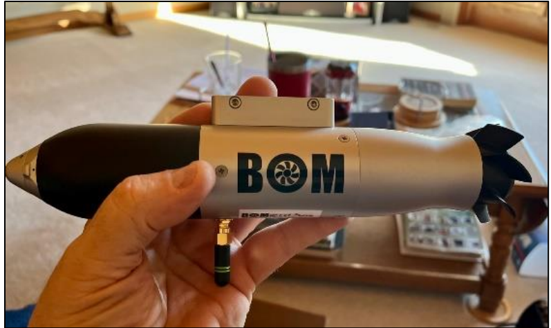
The BOM. Handle with care.