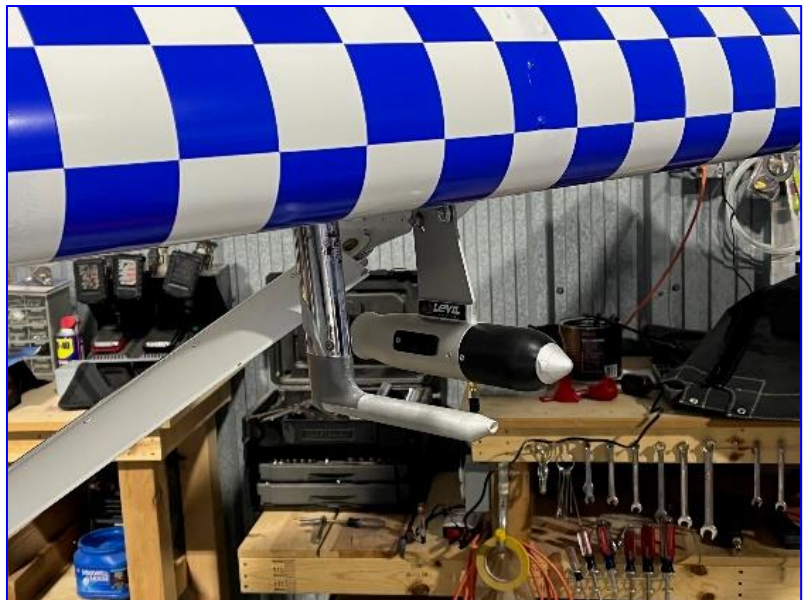
Mounted on the left wing. No wire runs to make.