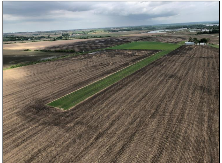
Butch flies out of Field of Dreams , a grass strip located a few miles southeast of Springfield, NE.