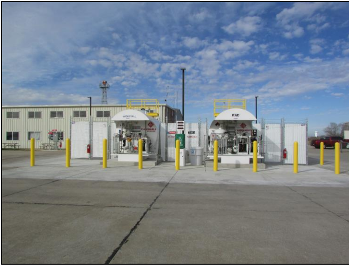
The completed installation of the 10,000-gallon tanks, November 20, 2021.