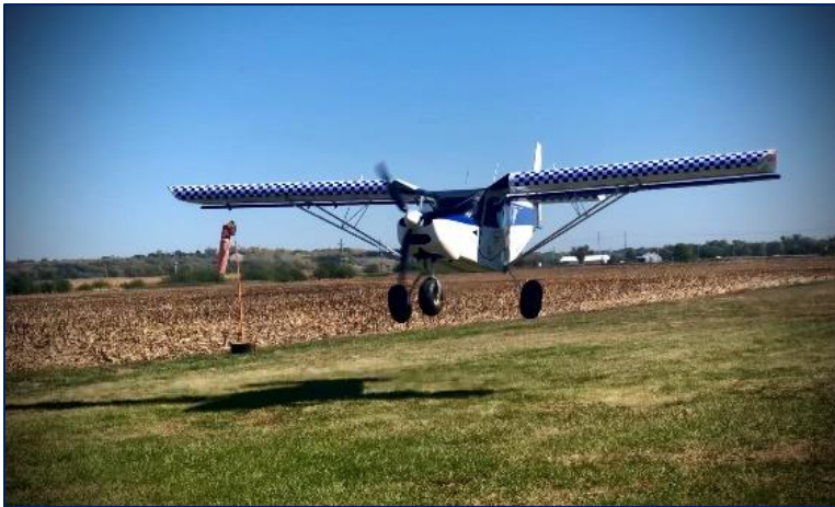
N257J is powered by a 100 hp Rotax ULS.