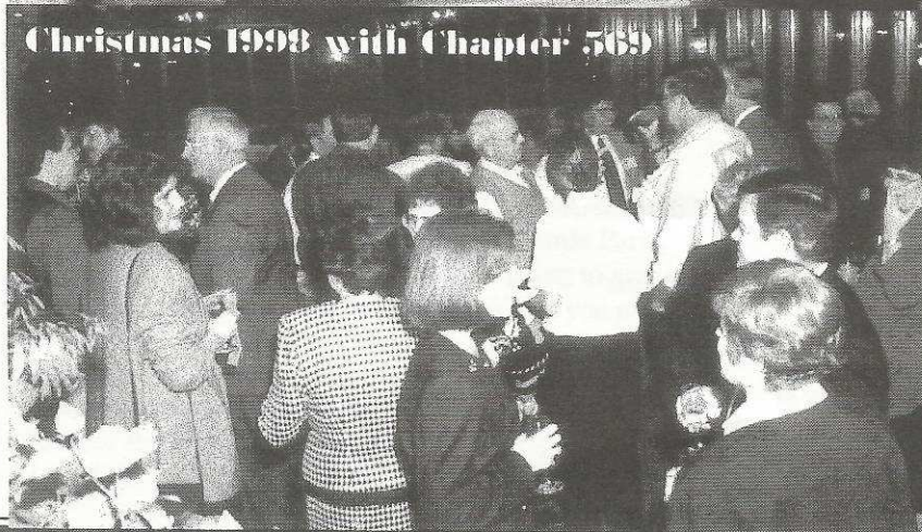
Christmas 1998 with Chapter 569