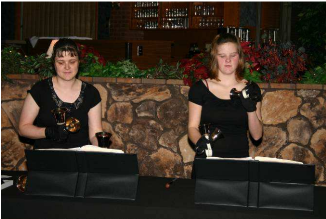
Entertainment provided by the Bell Ringers from Piedmont Park Church.