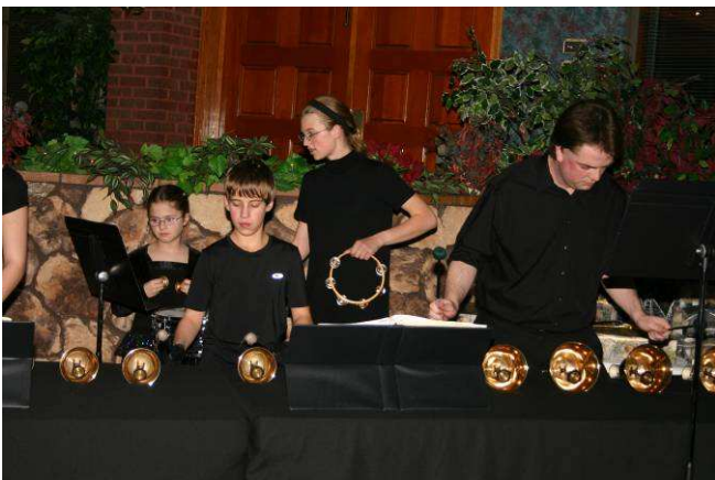
(More Christmas Party photos at www.eaa569.org . Just click on Photo Gallery.)