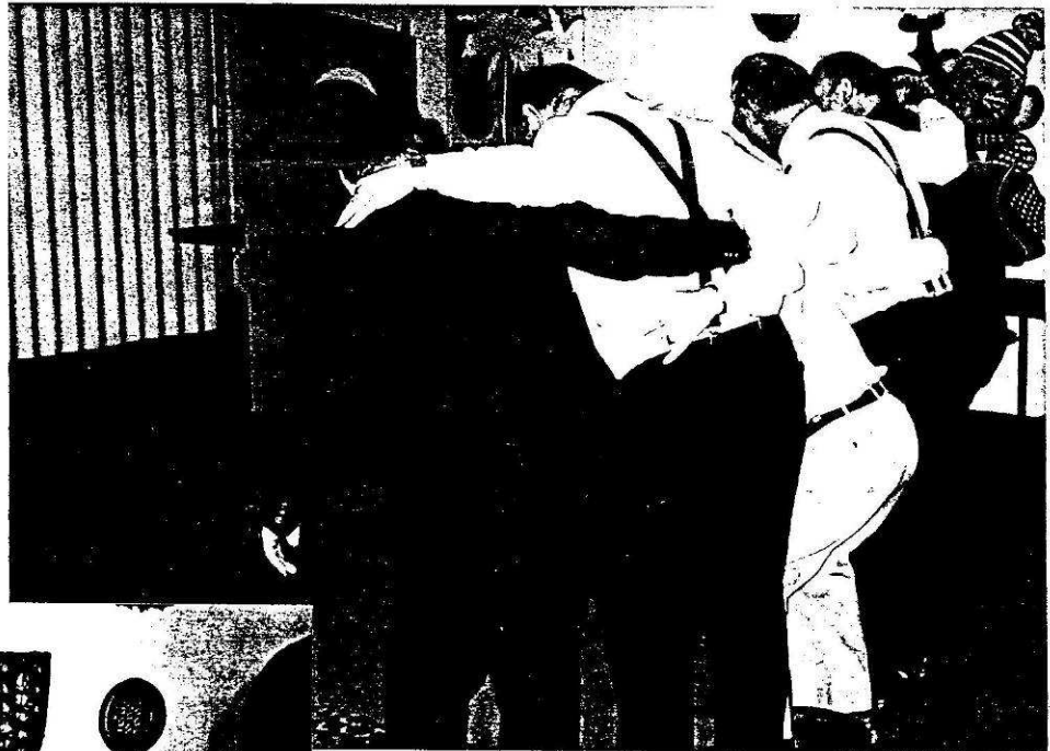
A classic demonstration of "backfield in motion"