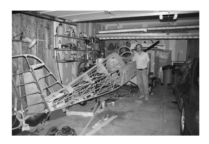
Rich Boelts with his Avenger fuselage.

The Avenger will first fly as an Ultralight and then it will be upgraded to a Light Sport Aircraft Experimental license to take advantage of added fuel and performance.