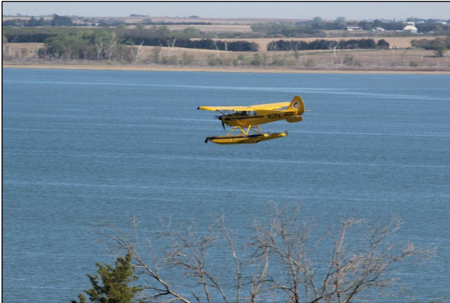
The floatplane landed midmorning on Saturday. The weather and water conditions were perfect for seaplane operations.