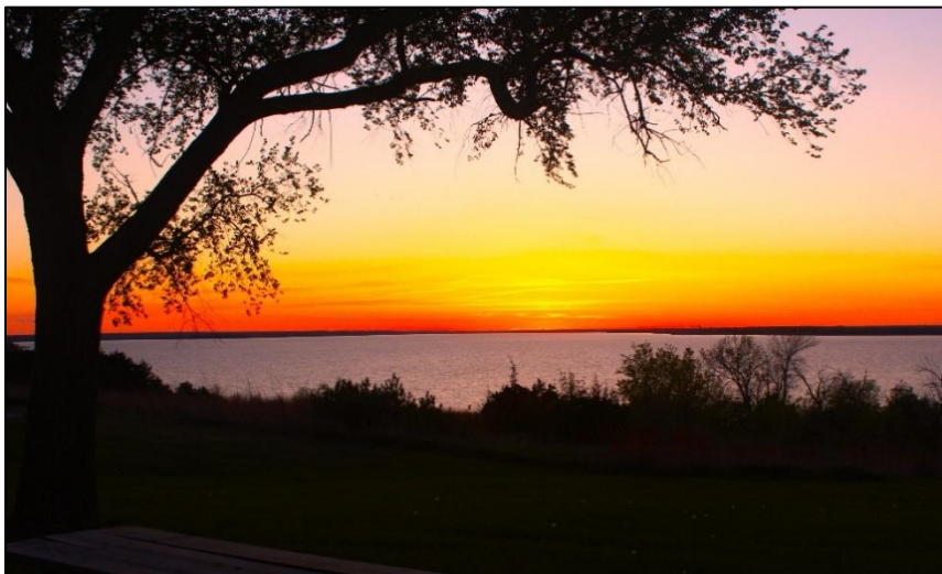
The Friday evening attendees were treated to an absolutely gorgeous sunset over the lake.