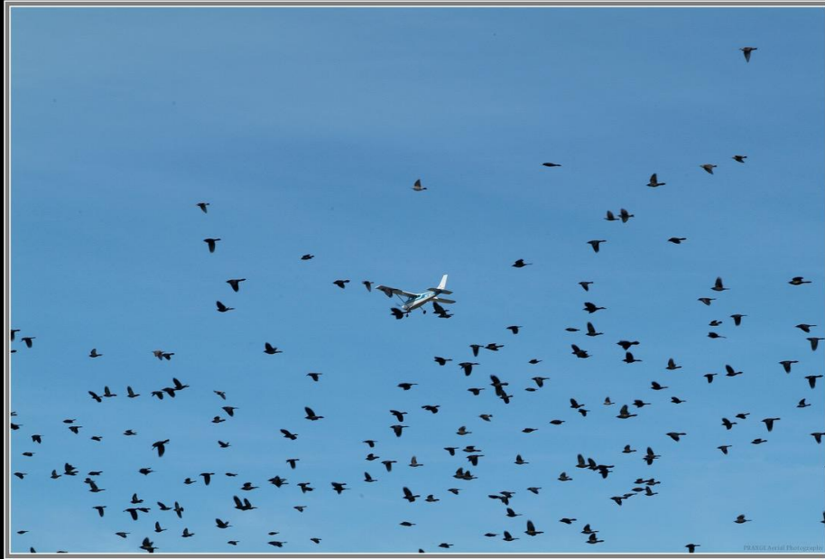
Birds Of A Feather