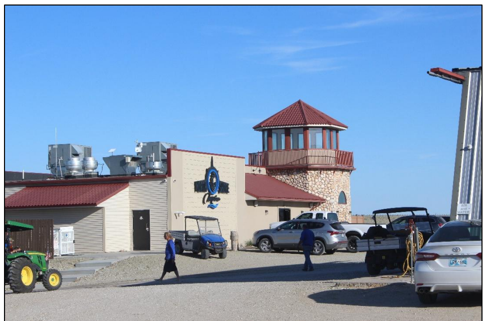
The event concluded with dinner on the deck of the marina restaurant. Those hardy enough to stay awake after two days of activity finished with a gathering in the beachside bar.