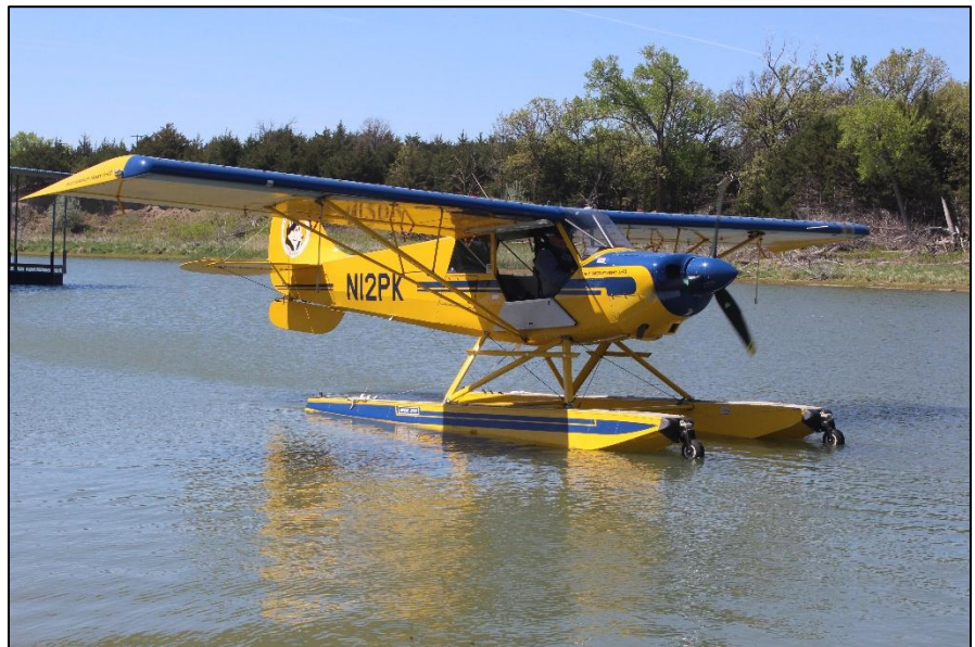
The airplane is an Aviat Husky A-1B on amphibious floats. The reversible pitch prop allowed it to back away from the beach. Larry Bartlett flew the craft from Lincoln.