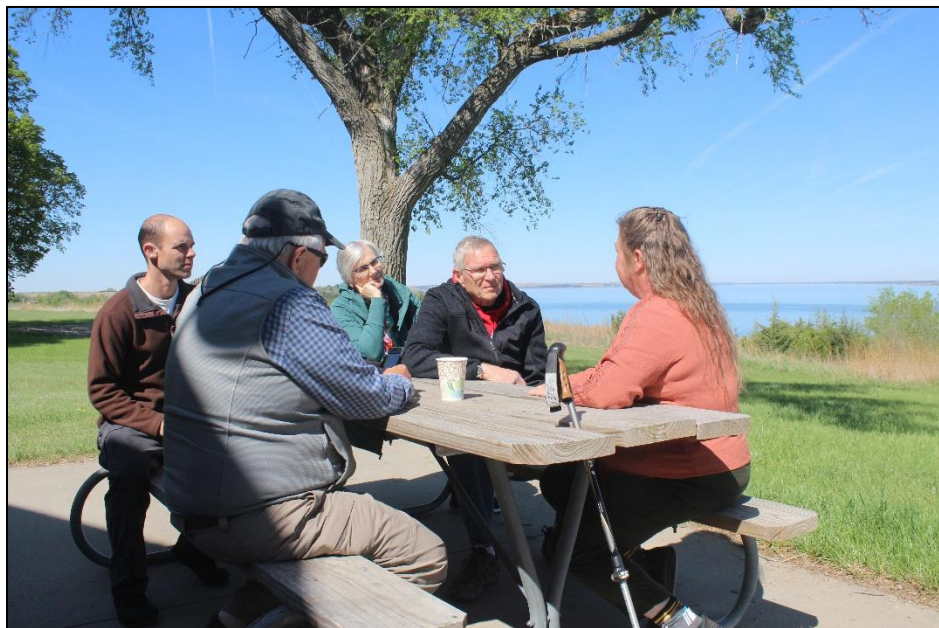
There were many “hangar flying” sessions. The Bravo Sierra was intense.