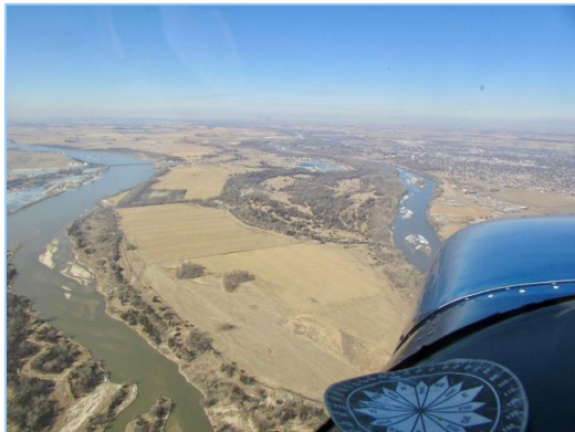
The ever-changing confluence of the Loup and the Platte makes Columbus a favorite destination.

south-facing hangar, especially in winter, when my north facing hangar would have black ice over the apron. Kerm's hangar was certainly a cheerier place, in sunshine instead of shadow! Glad times.