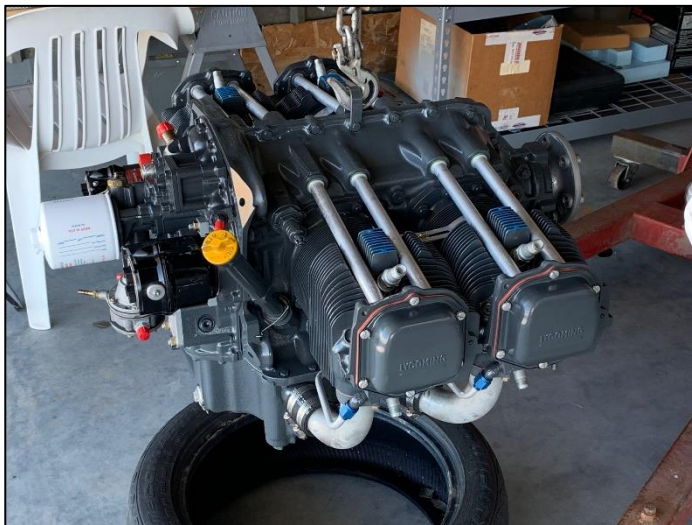
From Paradise, CA to Eugene, OR to Lincoln, NE.