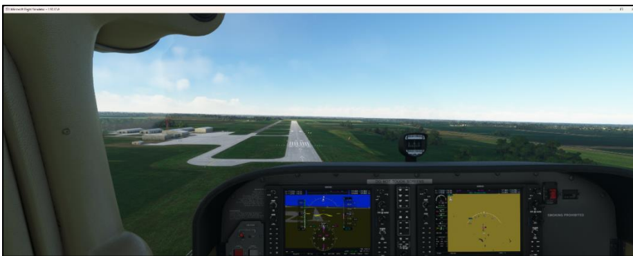
On final for York in the Cessna 172.

Now if it just had an RV-7 in the fleet.