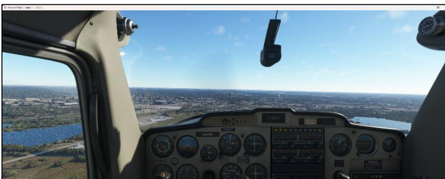
Right downwind for 35 in Lincoln.