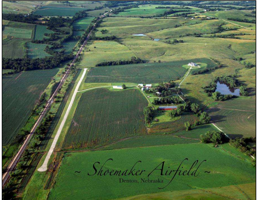
Don and Yvonne’s acreage. A pilot’s dream! They’ve kindly hosted the Chapter picnic the past several years.

Who would’ve thought by placing a simple ad in Trade-a-Plane would’ve opened the door to such memorable trips?