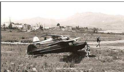
Don’s Taylorcraft at the Apple Festival Parade in Wenatchee, WA.

The trip back up to Spokane was uneventful and they were able to do it in one day.