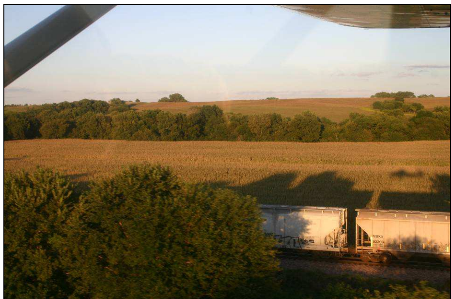
"Low and Slow"

Wow, the year is almost over. Where did the time go? I made it to the chapter breakfast and I was impressed by the turn out. The cars were parked out all the way to the main street. There was very little room on the ramp for any more aircraft to tie down. And of course the breakfast was delicious as always. I got caught up with old friends and did some hanger flying. It's November and that means it's time for elections once again. Anyone who wants to get more involved with the club and with more activities, this is the time to come forward. I hope to see everybody at the November meeting. Happy landings!