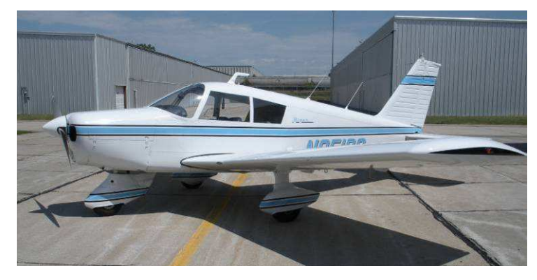
Aircraft TT: 7,435 hours Asking $30,000

Airplane is hangared at the Lincoln Nebraska airport