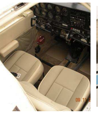
July 2014 Annual New Airtex interior