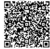
Scan for Google Map Directions

½ Block East of the Auld Pavilion Recreation Center, 1650 Memorial Drive, Lincoln, NE