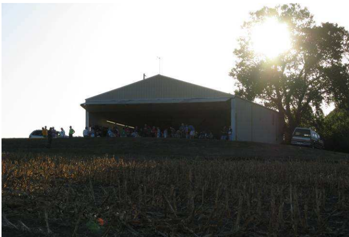
The sun beginning to set at Shoemaker Airfield, but still plenty of "hangar flying" going on.