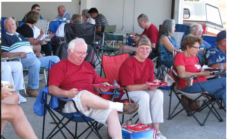
(More photos in the photo gallery at www.eaa569.org/gallery )