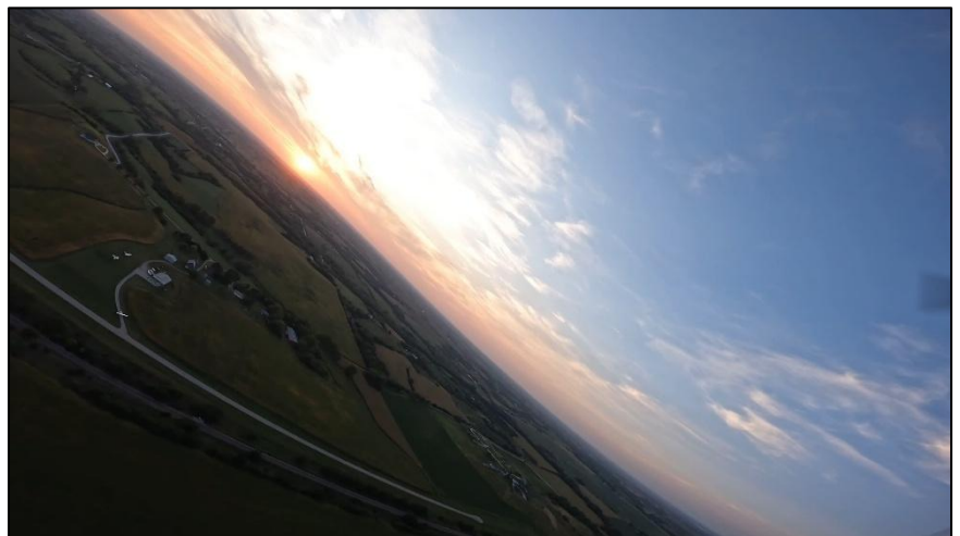
Planes departing Shoemaker field as the sun begins to set.