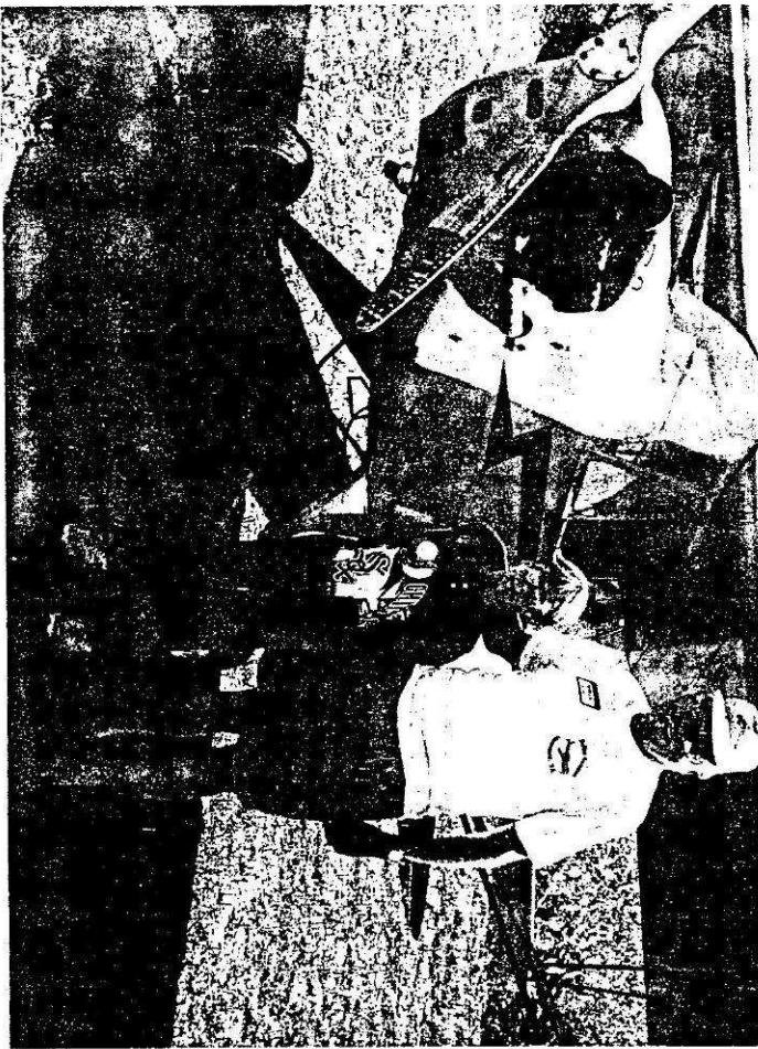
Young Eagles Day II - Pilots and Eagles