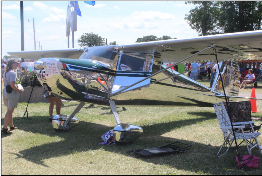
This 1947 Cessna 140 took home a Reserve Grand Champion Silver Lindy Award.