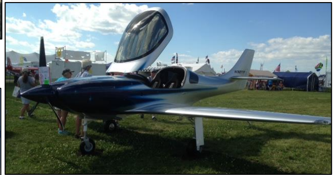
This Lancair Legacy RG, just completed in July 2016, took home a couple awards including Grand Champion Kit Built.