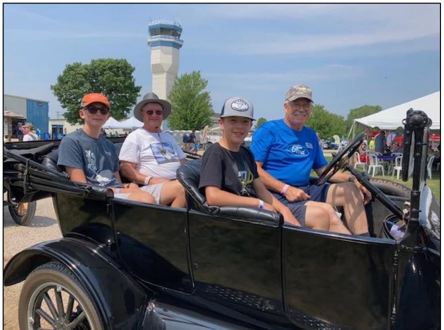
A ride in a Model T.