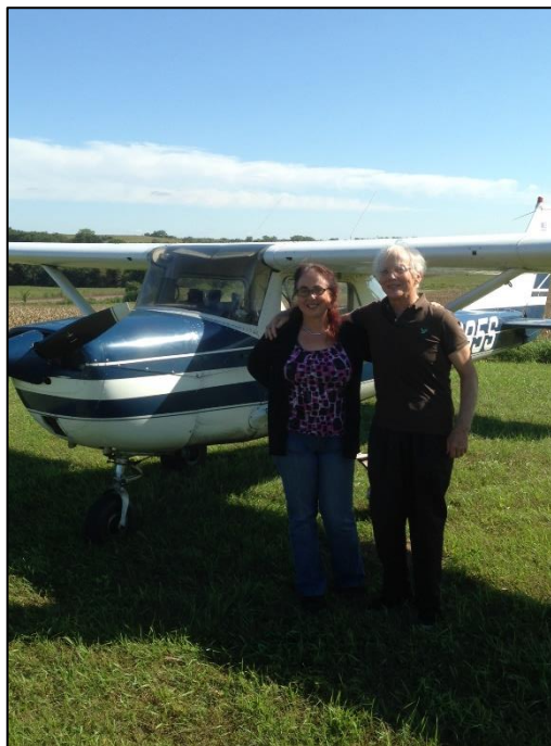
The Bluebird of Happiness coming to an airport near you, maybe.

All of which brings me back to the title, and to the theme of uncertainty: Will I go? I don’t know. Life is uncertain, eat dessert first. I may just pretend I’m in Denmark.